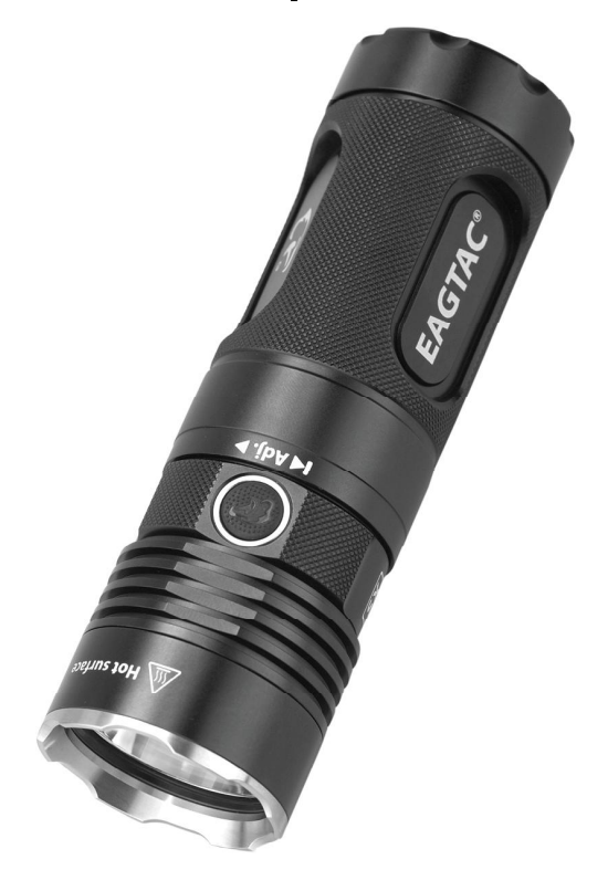
FEAGTAC High Performance Tactical Flashlight http://www.eagletac.com

EAGTAC SX25L3 and MX25L3 packs big 2750 lumen in a very compact and convenient body. It offers versatile user interface, tough build quality and rich accessories like no other. Be crazy lumen output with you in the dark.